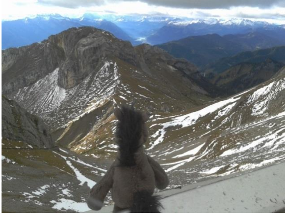
A pony at Mt Pilatus – Switzerland.