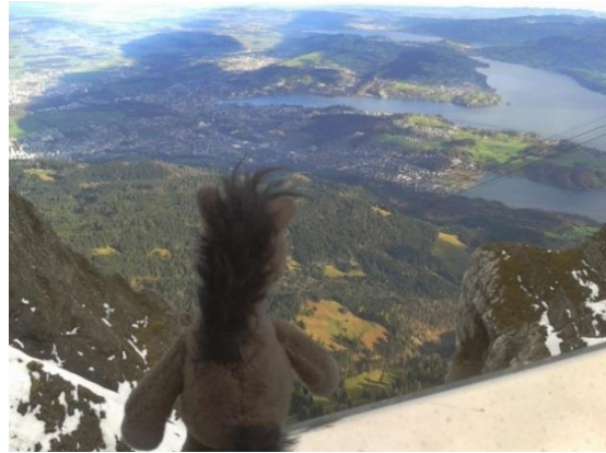
Hang on little pony – Mt Pilatus Switzerland looking over Lucerne.